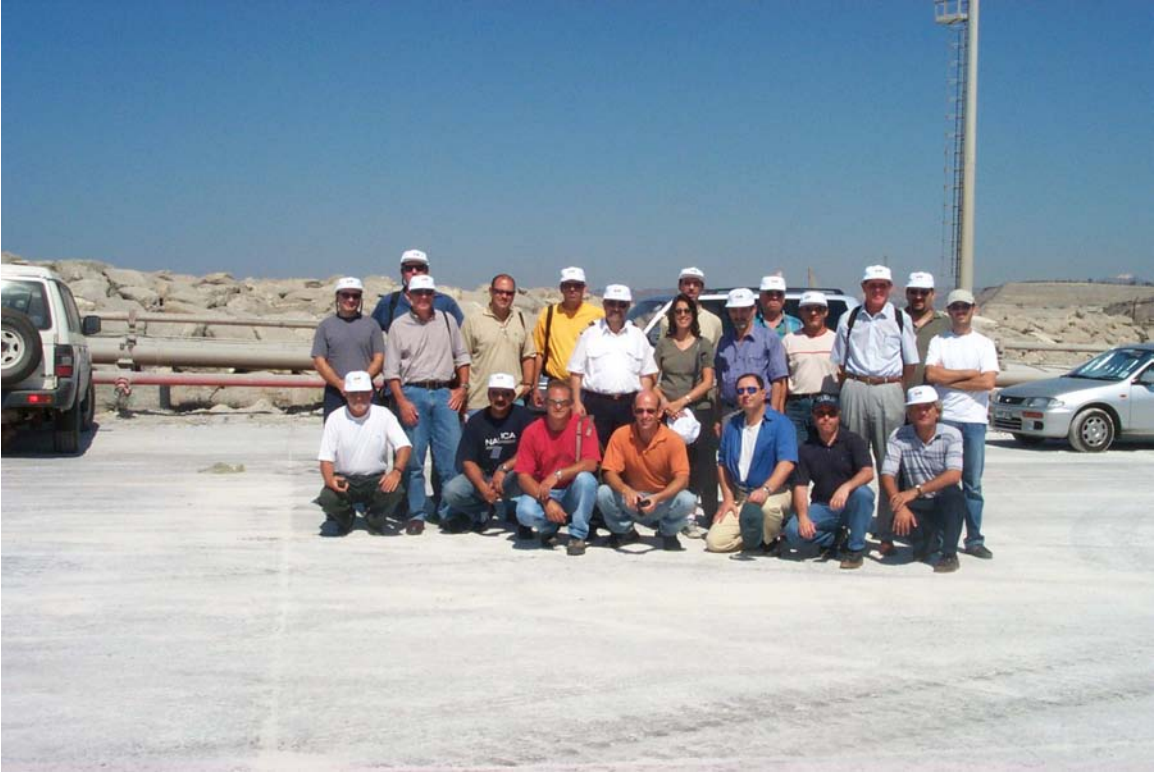
Group photo of participants - Larnaca, Cyprus - 4 July 2003