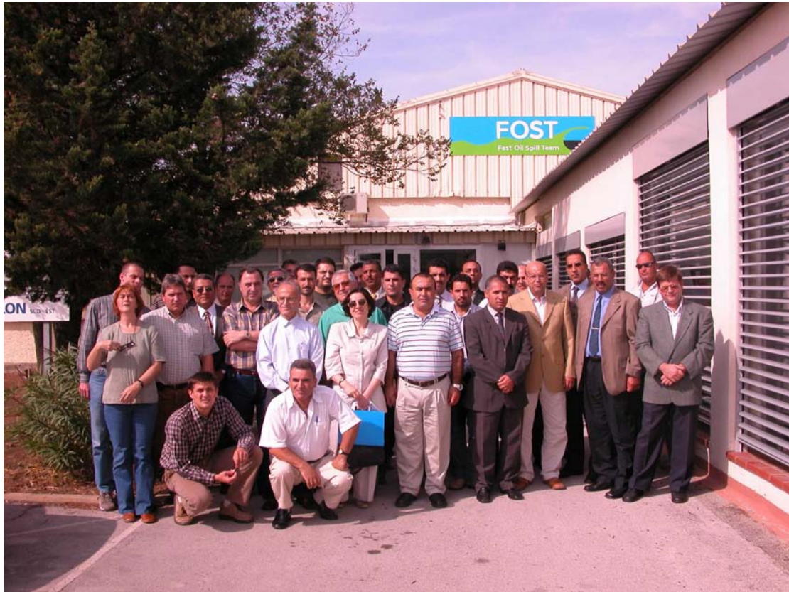
Group photo of participants during field visit to FOST at Rognac